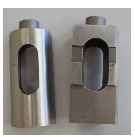
Old type - Composite Construction.

So what went wrong? Some have questioned the expansion of the new alloy. The expansion of this new alloy is 0.0001'' more than the cast iron tappets at 108 C, so not enough to explain the seizure. This now suggests that clearance could have been an issue. From the drawings it can be found that tappets are of 1.185/1.186'' diameter, the tappet tunnel is 1.1865/1.1875. From this you can see that the tolerance varies from 0.0005 – 0.0025''.