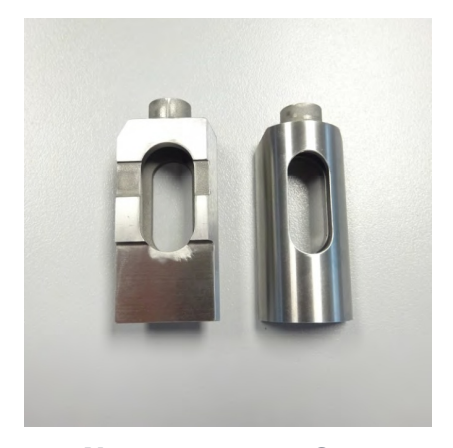
New tappets - One casting.

barrel could not be examined at ANIL as I was on holiday.