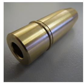
Norton 850 Exhaust